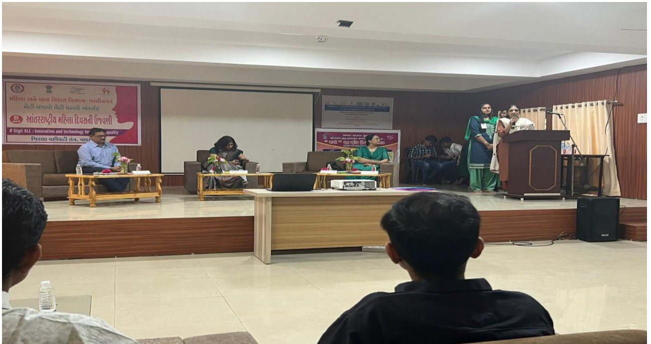
Speech by Faculty members