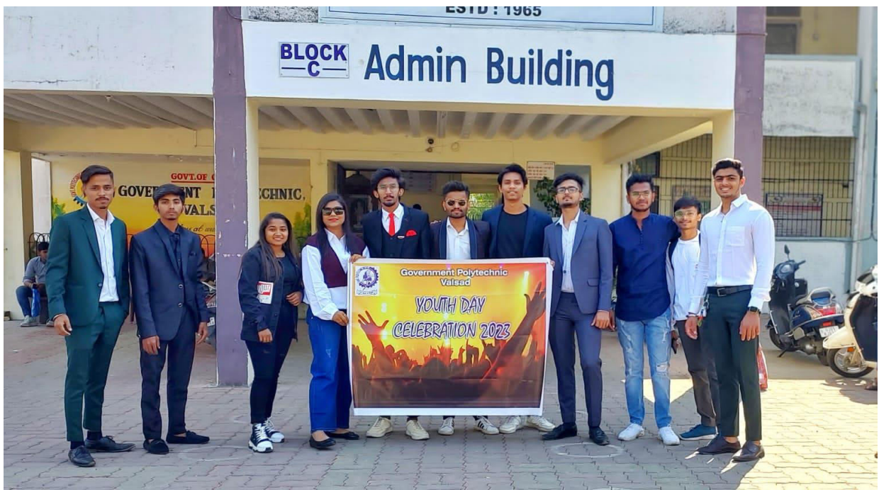
Youth Celebration Day