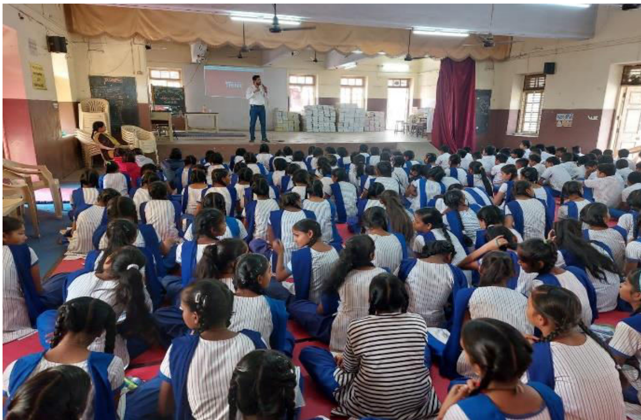
D. C. O Sarvajanik High School, Pardi