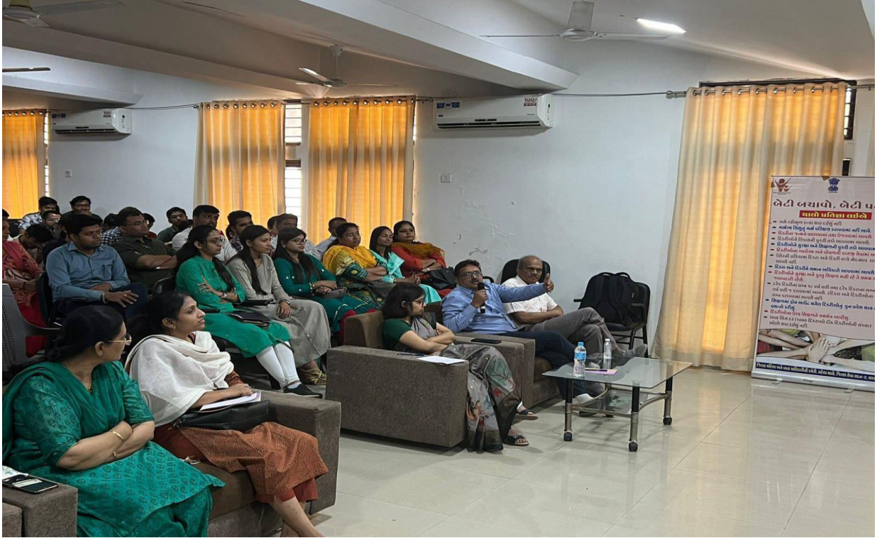
Question Answer Session