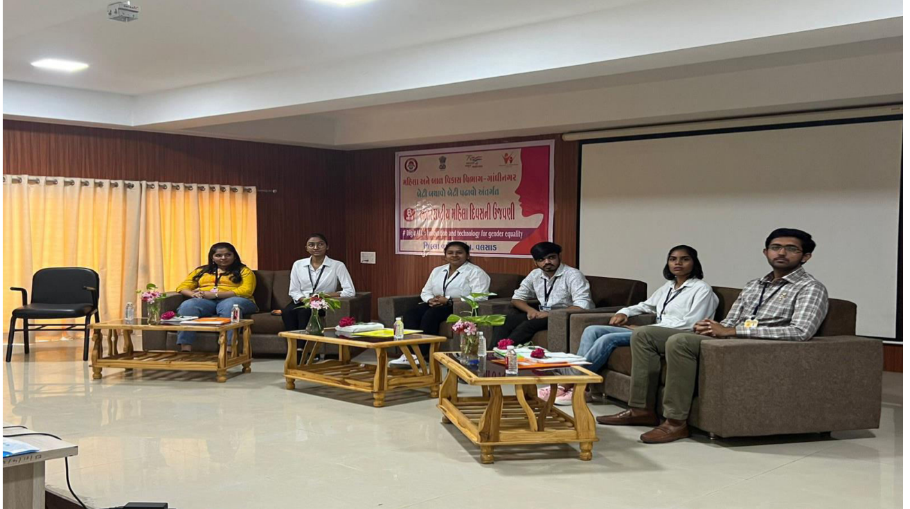
Discussion by students