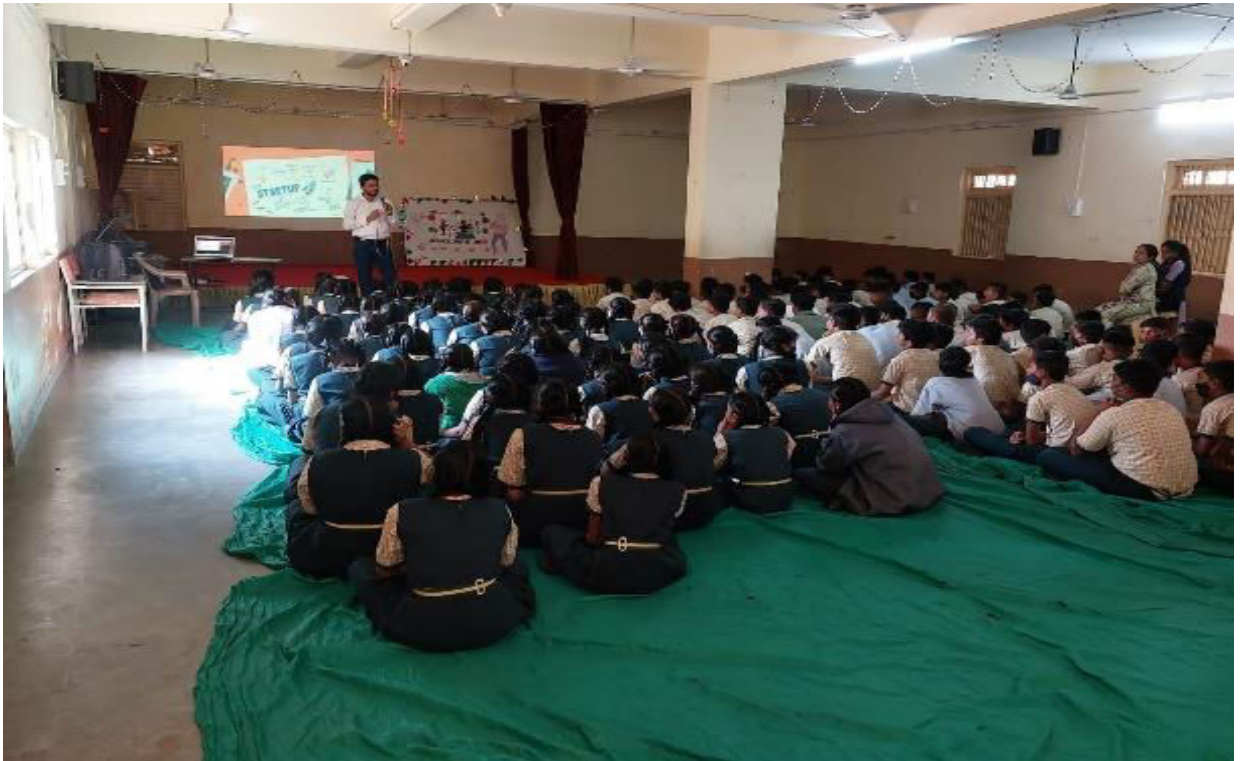
R. J. Damanwala Gujarati Medium School, Pardi