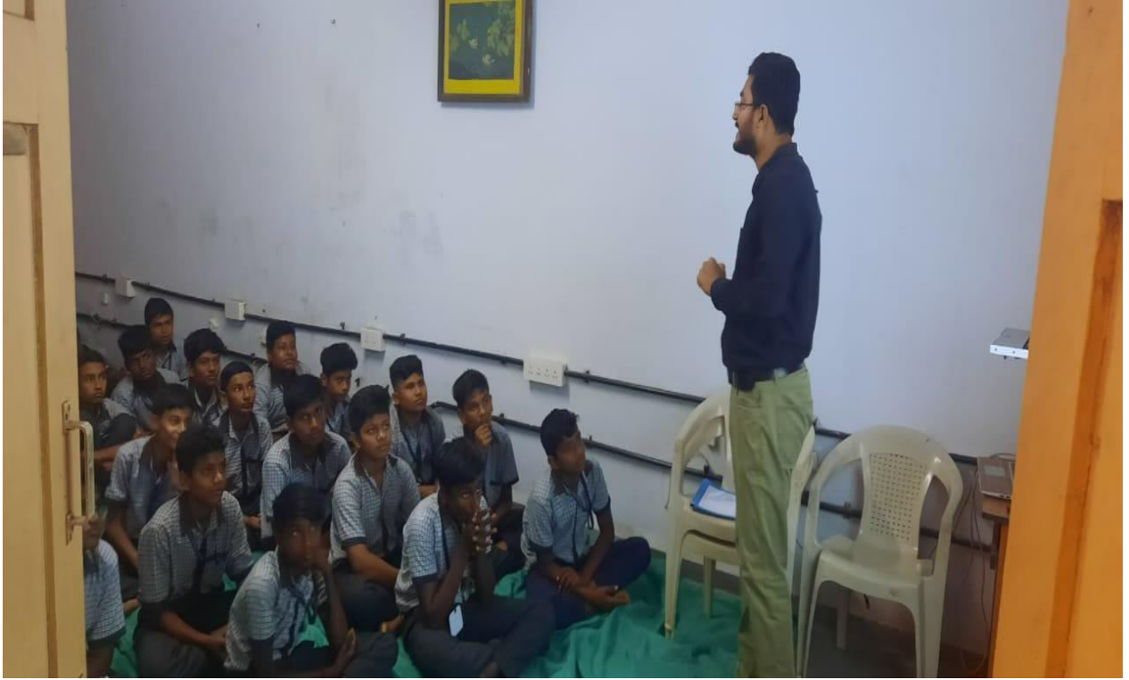
G. V. D Sarvajanic High School, Valsad