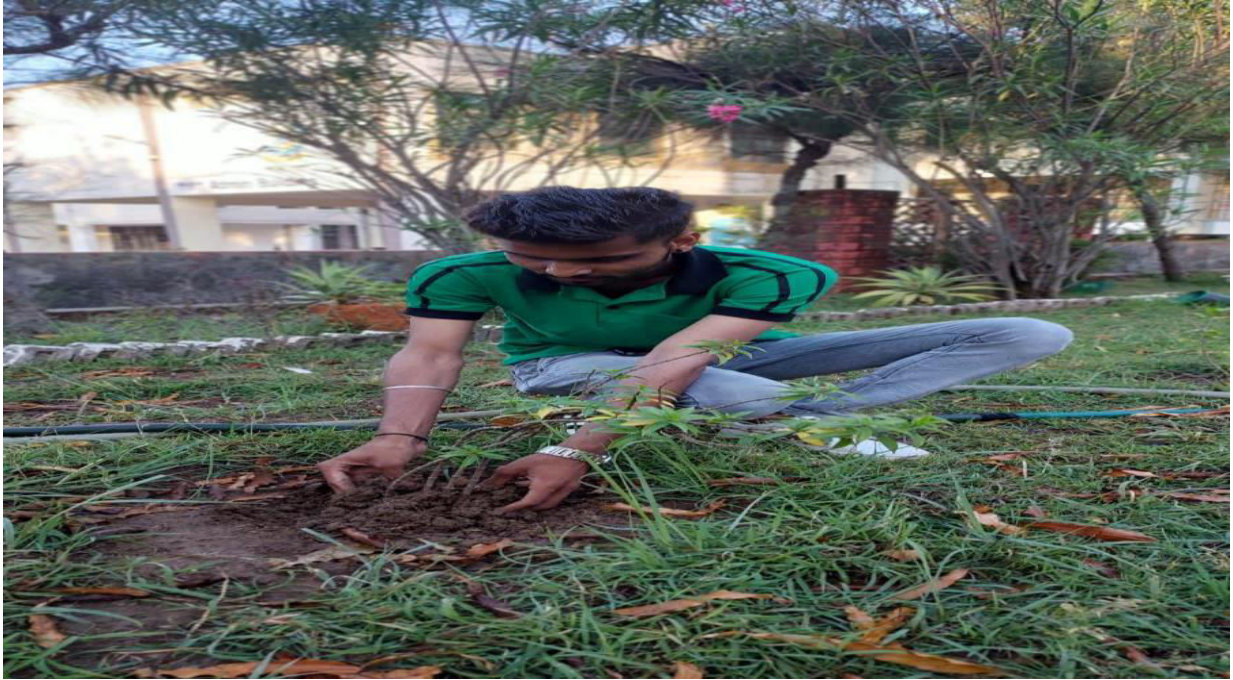
Tree Plantation Drive